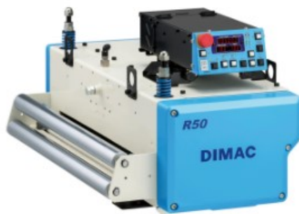
DIMAC R50 - SCHEDA TECNICA